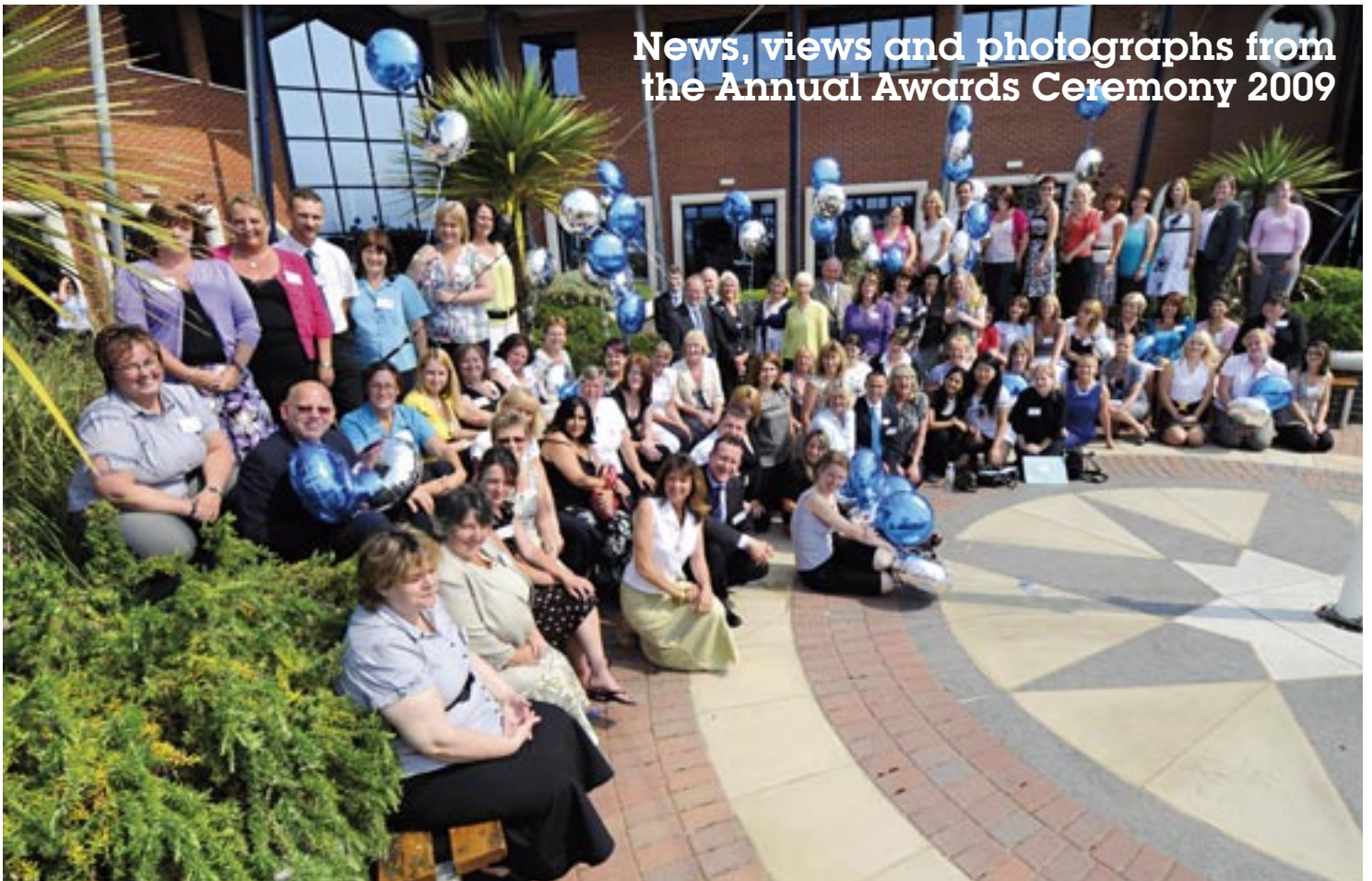
News, views and photographs from the Annual Awards Ceremony 2009

On 2nd July Care South celebrated its Annual Awards Ceremony at the RNLI Lifeboat College in Poole. Staff from all Care South residential homes and domiciliary care operations were represented at the "Simply the Best" themed event.