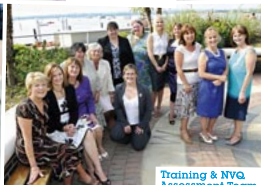
Training & NVQ Assessment Team