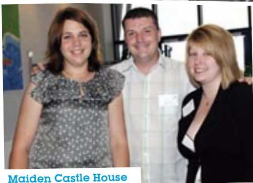
Maiden Castle House