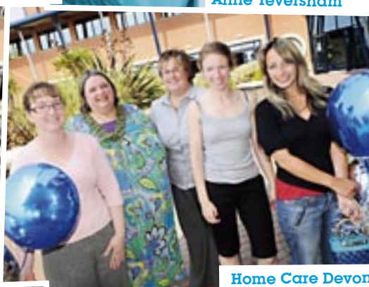
Home Care Devon