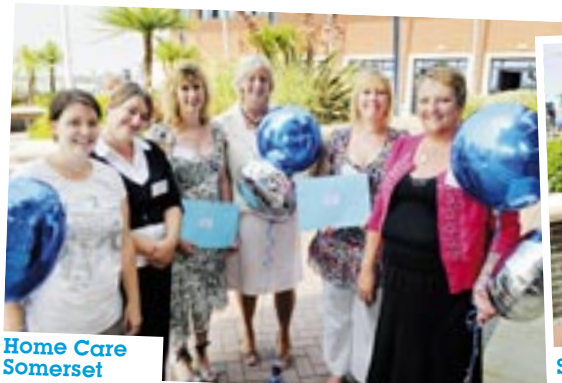
Home Care Somerset