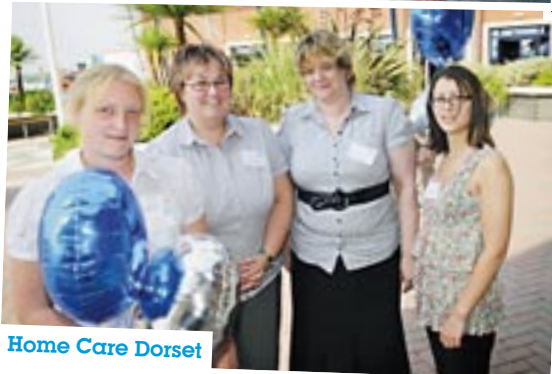
Home Care Dorset